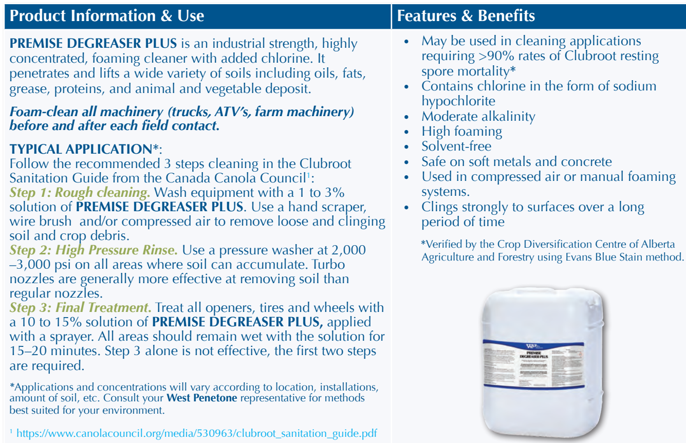
Efficacy of Premise Degreaser Plus in different concentrations on Clubroot resting spores in solution.